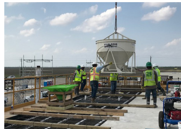
FDLLC crews pour concrete segments for the new Harbor Bridge.