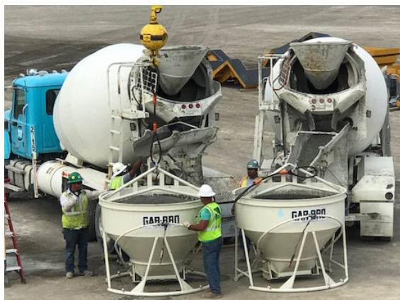
FDLLC crews prepare concrete to pour segments that will be used to construct the new bridge.

October 21: HBP Sidewalk Talk Pre Cast yard 10 a.m.