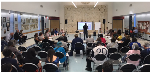
May 2017 Community Advisory Board Meeting