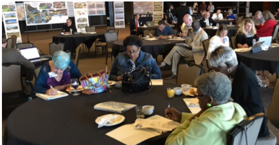
Community representatives were on hand to assist with the development of final design preferences at the final Design Charette.

Representatives with the Harbor Bridge Project hosted a final design charette that was held on May 23. More than 200 invites were sent to a cross-section of the community, which included elected officials, area city and county leaders, business groups and neighborhood representatives. The interactive workshop included open discussions on a variety of project design elements, in which participants had the opportunity to share ideas and provide preferences for the aesthetic features of the new signature bridge. A first design charette was held on September 22, 2016, and focused on bridge and pedestrian design features. Design Charette #2 provided an opportunity for attendees to review feedback from the previous charette and assist with the development of final design preferences.