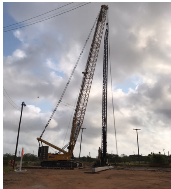
Test piling begins near Winnebago Street south of the Port as part of the Harbor Bridge Project construction progress.