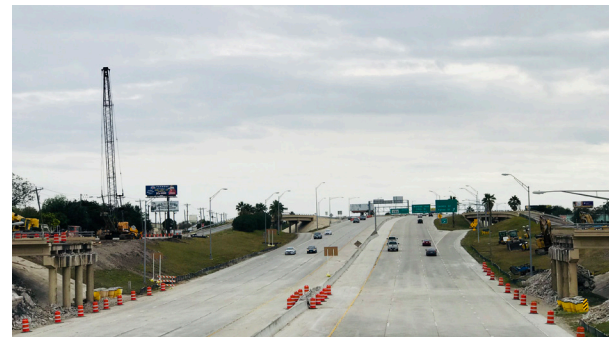
The current open view along the Crosstown Expressway will remain until the Comanche Street Bridge is rebuilt.