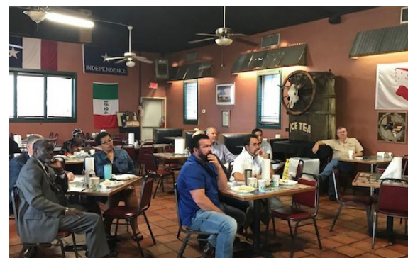
Northside residents and business owners listen to an update on the construction of the new Harbor Bridge.