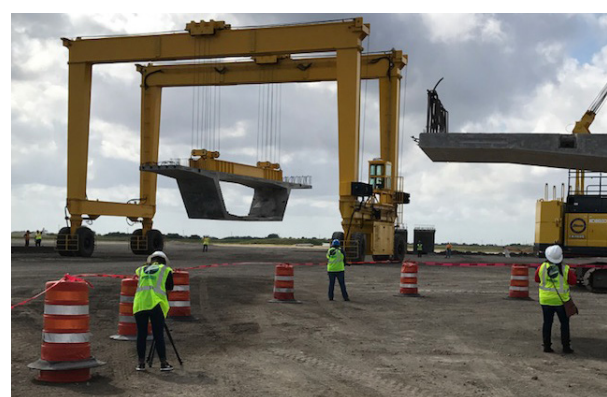
Local media capture movement of a 100-ton segment at the Pre Cast Yard in Robstown.