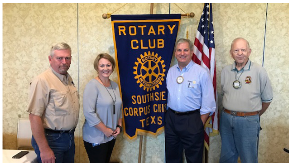
FDLLC team joined the Southside Rotary Club to present information on the Harbor Bridge Project.