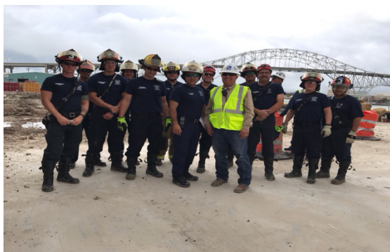
Corpus Christi Firefighters and Port of Corpus Christi team up with FDLLC to coordinate project rescue plans.

August 9: The Big Event DMC-Economic Development Ctr. 12 p.m.