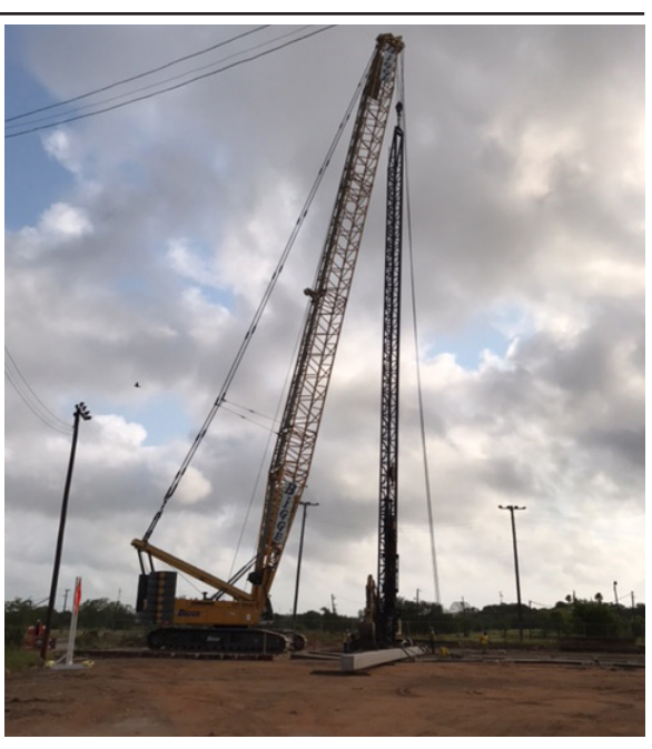
Test piling begins near Winnebago Street south of the Port as part of the Harbor Bridge Project construction progress.