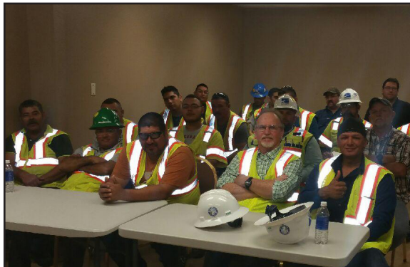
FDLLC employees and sub-contractors attend a Backing and Blindspot training that was held at the Flatiron Dragados, LLC Port Office.

February 24: Harbor Bridge Project San Pat County EDC-Industry 10 a.m.