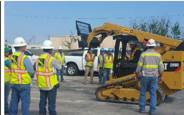
Equipment training is held for crew members at the project site.